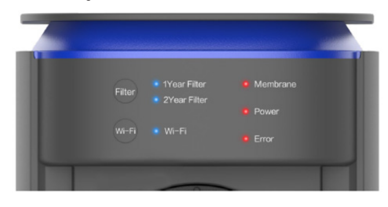
Figure 1. Smart RO unit LED indicators